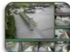
Fixed place monitor