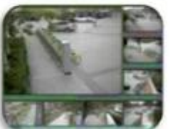
Fixed place monitor