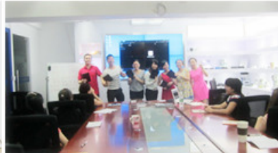
Inner Training after study from Alibaba in July