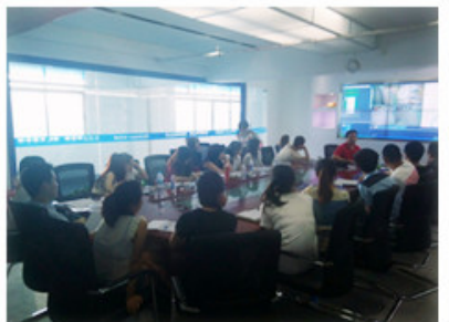
Technical Training For Fast Response to Customer Richmor 锐驰