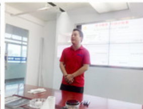
lecturer for Execution