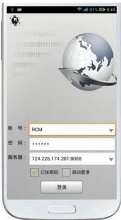
For IOS & Android OS Mobile Phone Surveillance