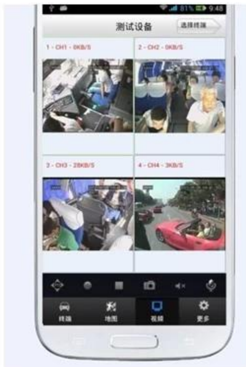
Our Mobile DVR project for vehicles