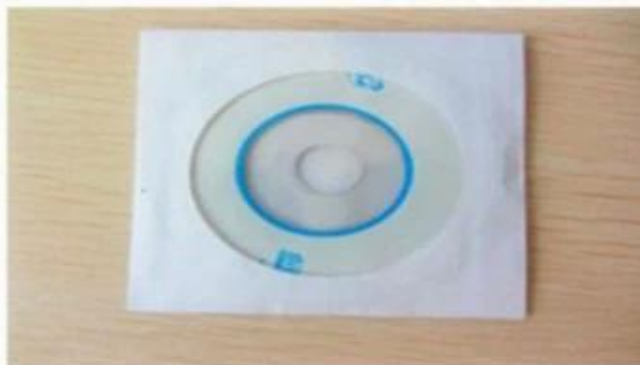
CD ( Manual & Software inside )