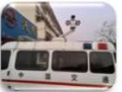
Traffic Inspection Car