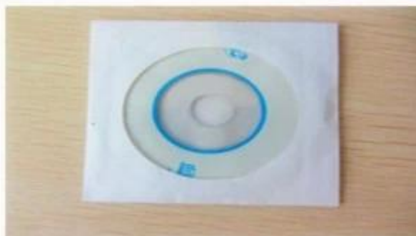
CD ( Manual & Software inside )