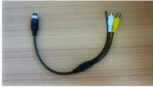
AV Output Cable