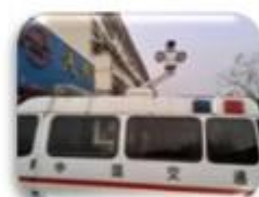
Traffic Inspection Car