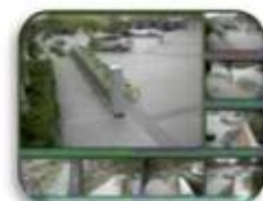
Fixed place monitor