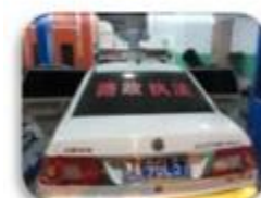
Road Police Car