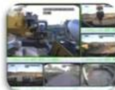
Civil Work Vehicle