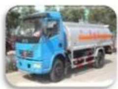
Dangerous chemical car