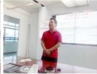
lecturer for Execution