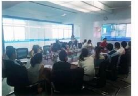
Technical Training For Fast Response to Customer Richmor 锐驰曼