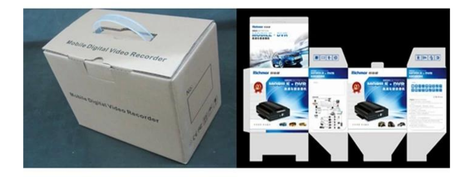
Professional Mobile DVR Manufacture: