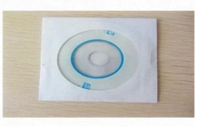
CD (Manual & Software Inside )