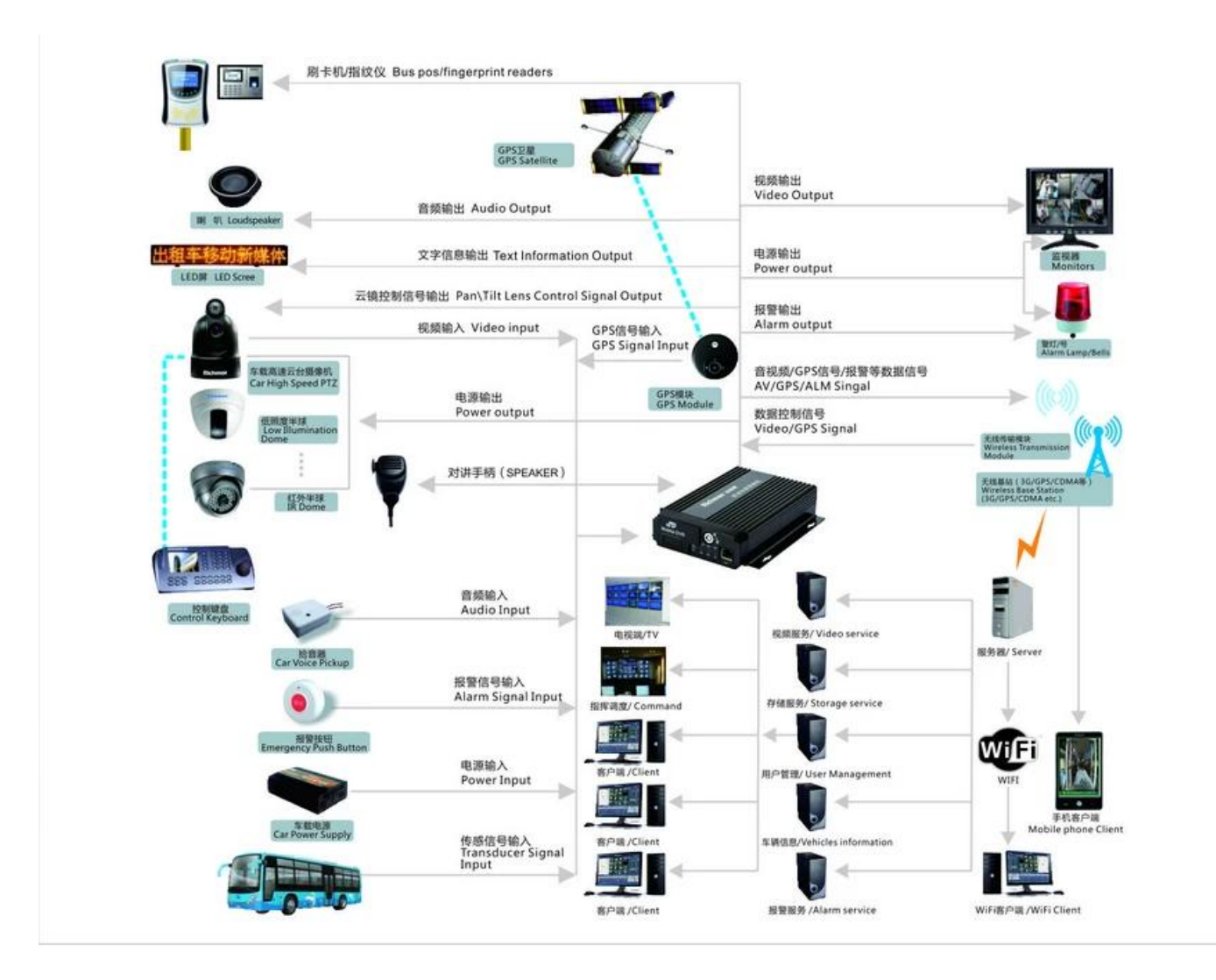
Other related kinds of mobile DVR