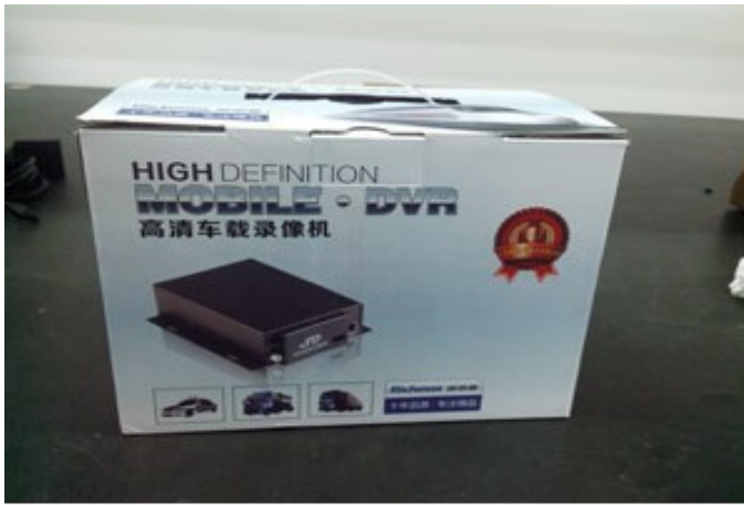
Richmor Brand Package