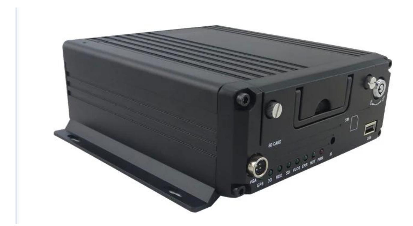
2017 4ch ahd mobile dvr with multy alarm input based on gps 3g wifi remotely control