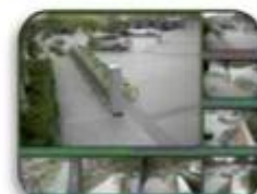
Fixed place monitor