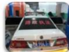
Road Police Car