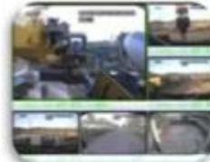
Civil Work Vehicle