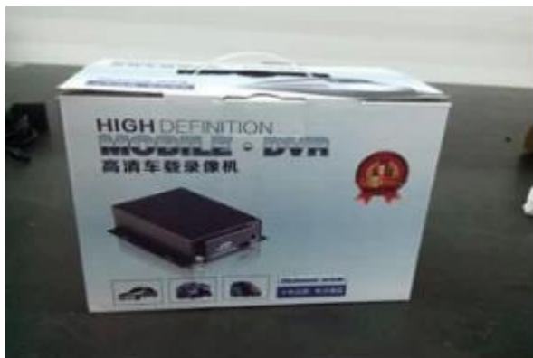
Richmor Brand Package

Neutral paper box or Color paper box with Logo Richmor printed,also welcome customized package.