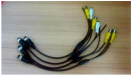
AV Input Cables