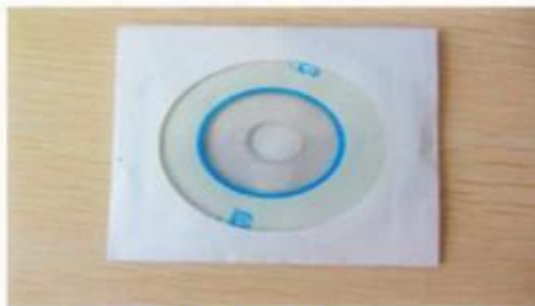
CD ( Manual & Software inside)

Neutral paper box or Color paper box with Logo Richmor printed,also welcome customized package.