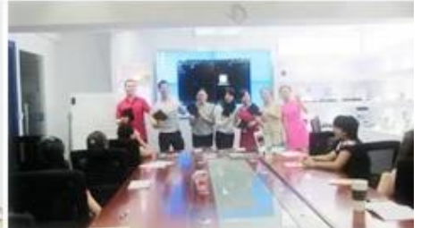
Inner Training after study from Alibaba in July