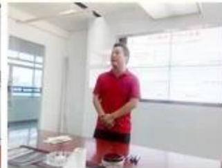
lecturer for Execution