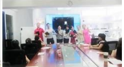
Inner Training after study from Alibaba in July