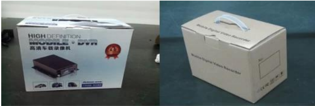
Richmor Brand Package