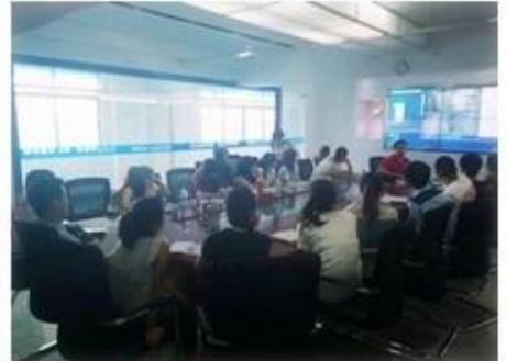
Technical Training For Fast Response to Customer Richmor 锐驰曼