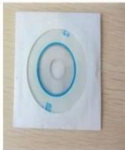
CD ( Manual & Software Inside)