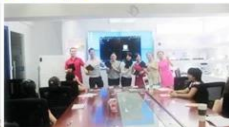
Inner Training after study from Alibaba in July