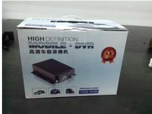
Richmor Brand Package