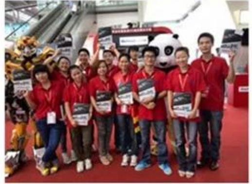
DVR mobile'S Certificazione: