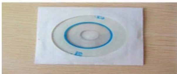
CD ( Manual & Software Inside)