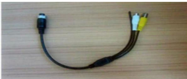
AV Output Cable