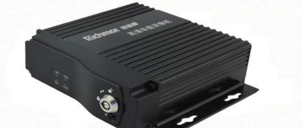
SD Mobile DVR