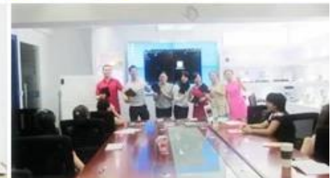
Inner Training after study from Alibaba in July