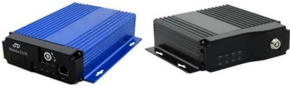
SD Mobile DVR with 3G GPS