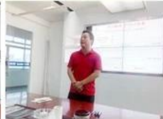
lecturer for Execution