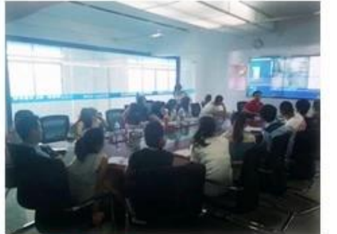
Technical Training For Fast Response to Customer Richmor 锐驰曼