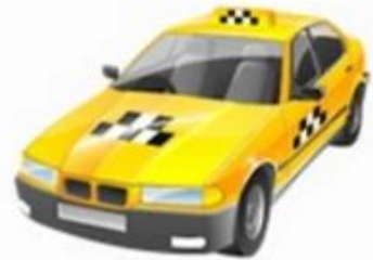
Taxi & Cab