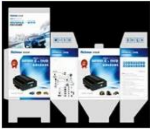
Box with Richmor