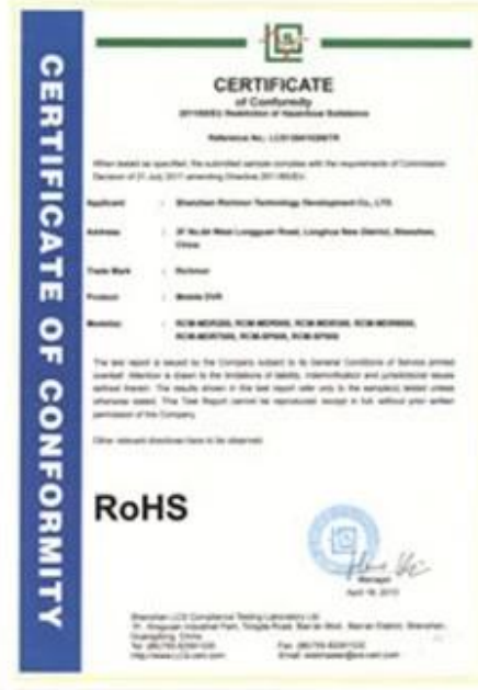
Richmor Otros productos: Cámara IP P2P HDD Mobile DVRE Embalaje de s: