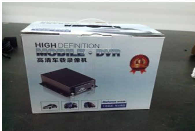
Richmor Brand Package

3. If the HDD is connect well, if the HDD/SD light is on.