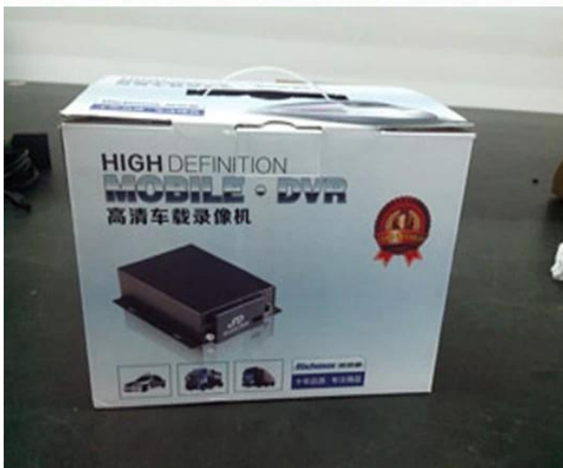
Richmor Brand Package