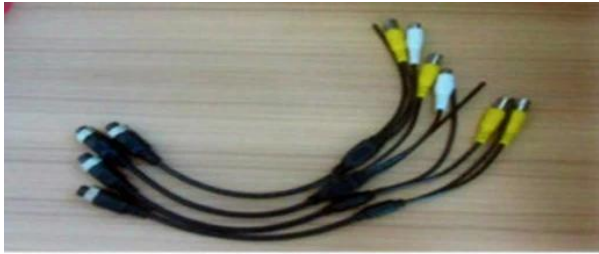
AV Input Cables