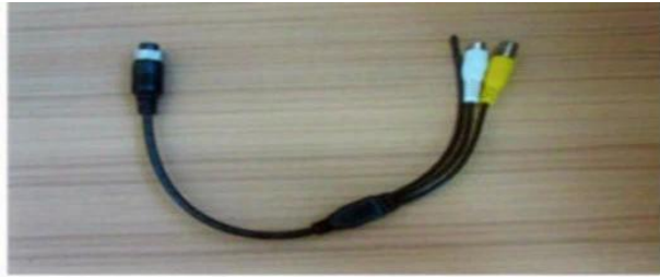
AV Output Cable