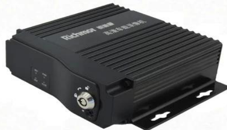
SD Mobile DVR