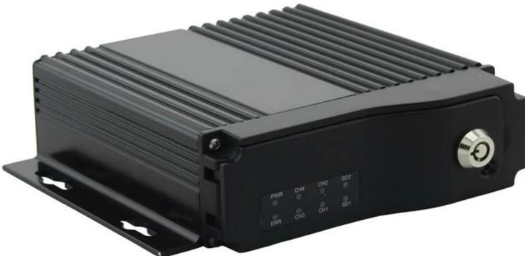
Imagen de disparo