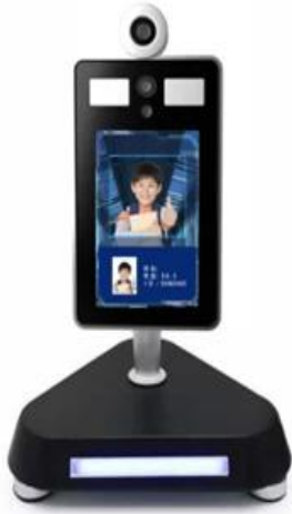
stand-floor, for office/school, ect