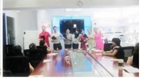
Inner Training after study from Alibaba in July