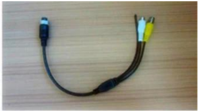
AV Output Cable