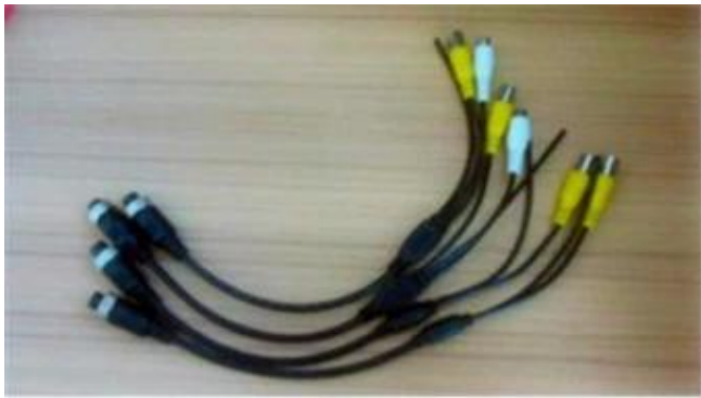
AV Input Cables