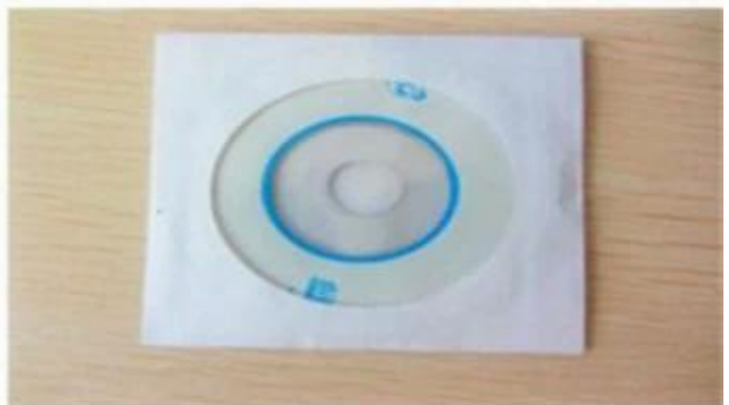
CD ( Manual & Software inside )