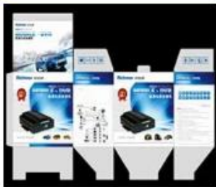
Box with Richmor