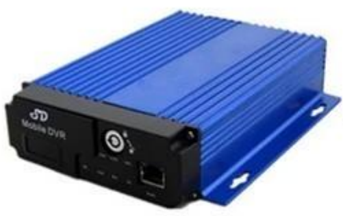
SD Mobile DVR with 3G GPS