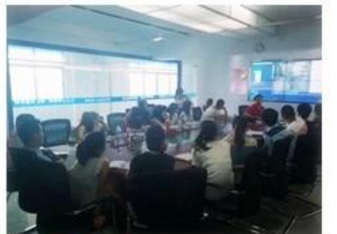
Technical Training For Fast Response to Customer Richmor 锐驰曼