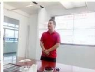
lecturer for Execution