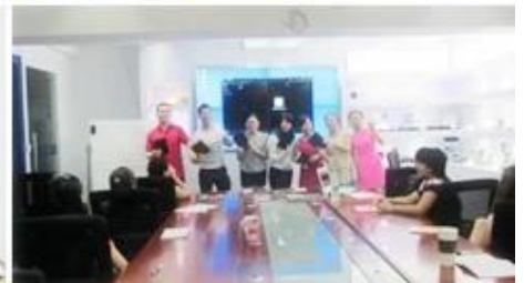
Inner Training after study from Alibaba in July