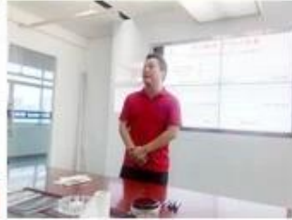
lecturer for Execution