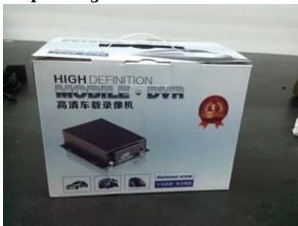
Richmor Brand Package