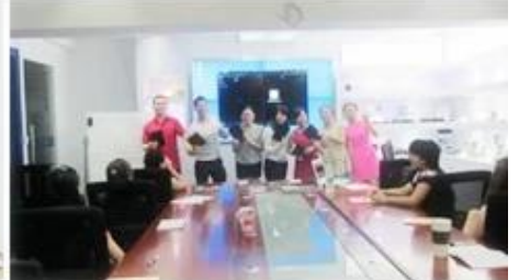
Inner Training after study from Alibaba in July