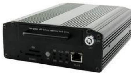
HD Mobile DVR with 3G GPS