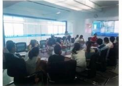
Technical Training For Fast Response to Customer Richmor 锐驰曼