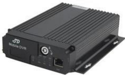
SD Mobile DVR with 3G GPS