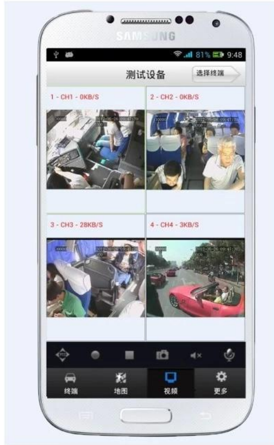
Richmor Car DVR Mobile Project