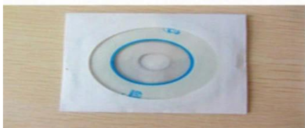
CD ( Manual & Software Inside)