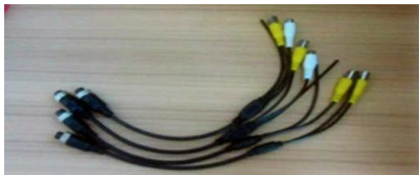
AV Input Cables