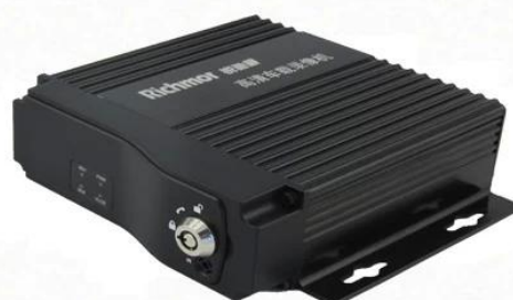
SD Mobile DVR