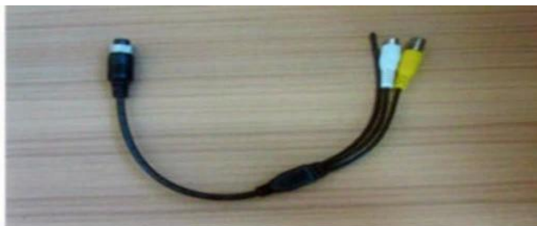
AV Output Cable