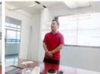
lecturer for Execution