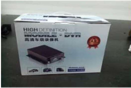
Richmor Brand Package