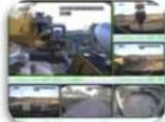
Civil Work Vehicle