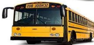
School Bus Bus