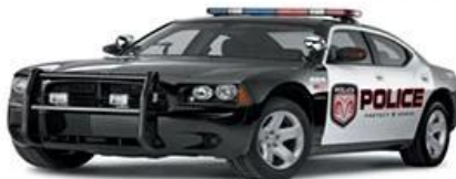
Police Car Taxi