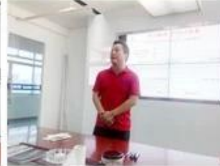
lecturer for Execution