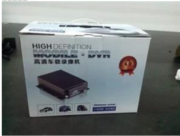
Richmor Brand Package