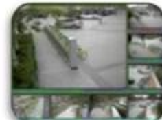
Fixed place monitor