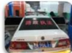
Road Police Car