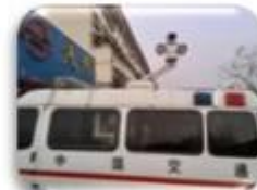
Traffic Inspection Car