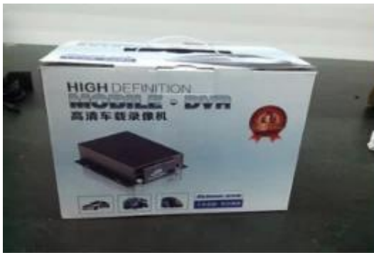
Richmor Brand Package