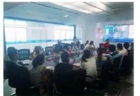
Technical Training For Fast Response to Customer Richmor 锐驰