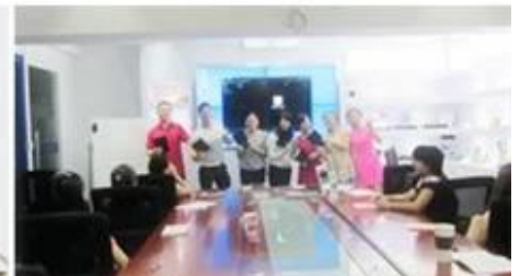
Inner Training after study from Alibaba in July