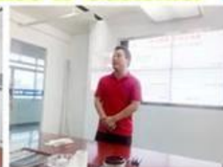
lecturer for Execution