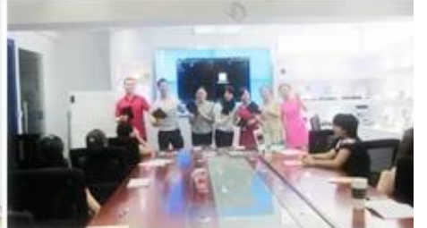
Inner Training after study from Alibaba in July