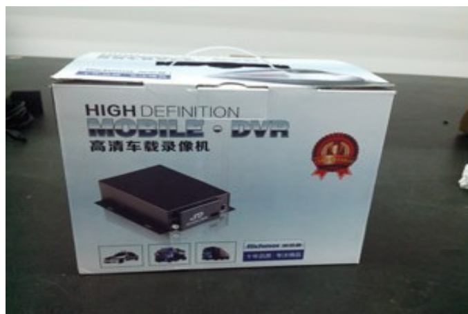
Richmor Brand Package

3. If the HDD is connect well, if the HDD/SD light is on.