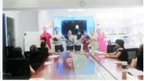
Inner Training after study from Alibaba in July